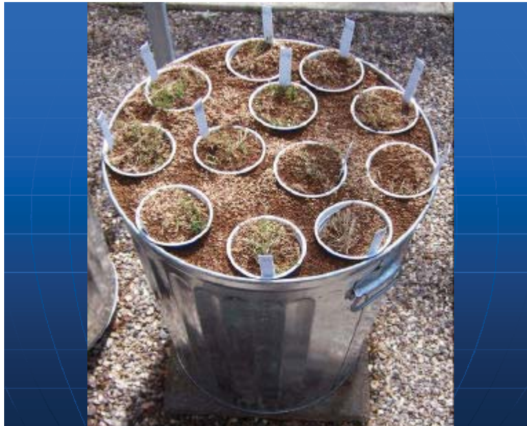
Fig. 2: Galvanized can (1 replication of the plants) containing fritted clay and the cups planted with saltgrass at the beginning of the plant establishment stage