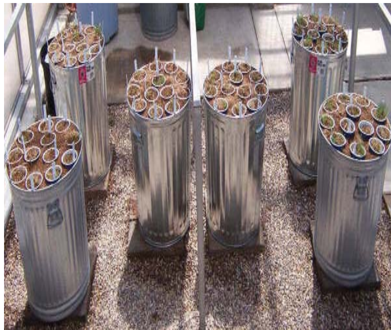
Fig. 3: Galvanized cans (3 replications of the plants for each of the 2 mowing heights for later stage of the drought phase of the study) containing fritted clay and the cups planted with saltgrass at the beginning of the establishment stage.

Two mowing heights (2.5 and 5 cm) and 3 replications of each mowing height were used in a split plot design (Fig. 3), where drought stress was tested as whole plots, with mowing height and grass selection combinations appearing as sub-plots, in this investigation.