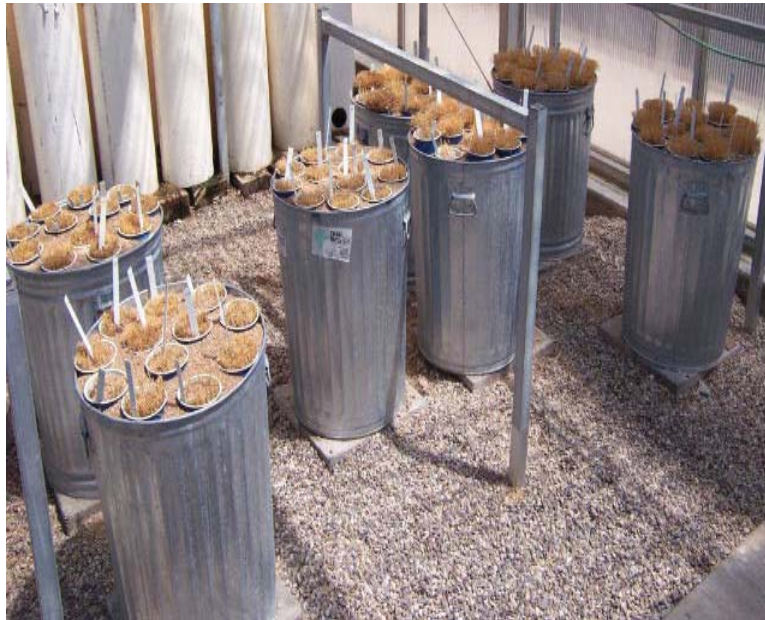
Fig. 4: Plants are either dead or in dormancy stage at the termination of the drought experiment

Drought Stress: A dry-down fritted clay system which mimics progressive drought [38] was used in this investigation. This procedure has been used successfully in our previous drought stress studies [20, 21]. The system imposes a gradually prolonged drought stress to plants (i.e., various saltgrass clones) planted in separate cups (experimental units).